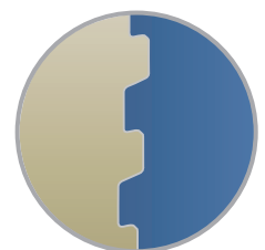
Patented hooked thread design