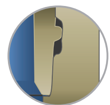
Internal metal-to-metal seal