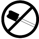
Do Not Use Bottle Brush

CAUTION: To much thread lubricant can cause connection damage and or seal ring damage on make-up. The problem is heightened with a high make-up speed.